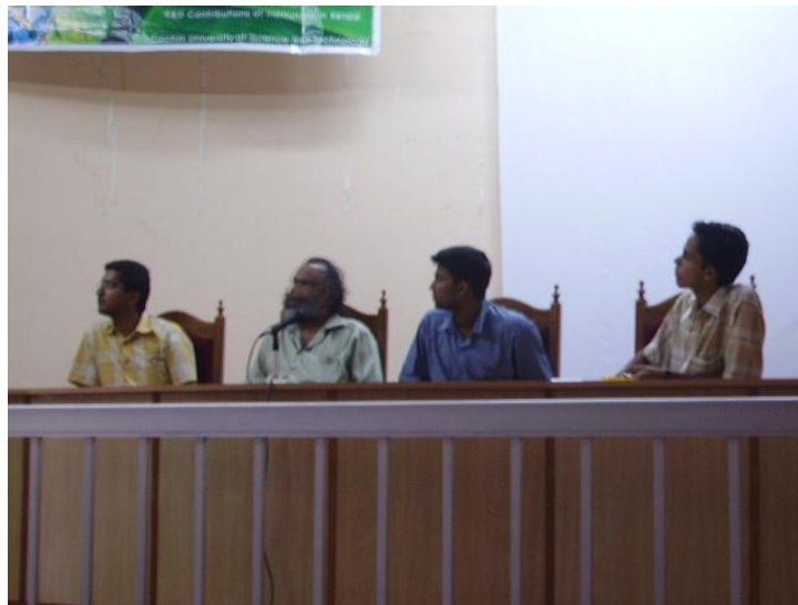
The chapter advisor [second left], president, vice president, and the secretary at the first meeting

The meeting elected the following office bearers for the coming academic year.