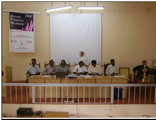
The inaugural meeting of the Annual Photonics Workshop 2007

The chapter joined hands with the International School of Photonics and ISP-OSA student chapter in organizing a two day National ‘Annual Photonics Workshop’ on 27 th and 28 th of February, 2007. About 50 participants comprising of University and college teachers, researchers, scientists took part in the workshop which had its focal theme as ‘Nonlinear optics’.