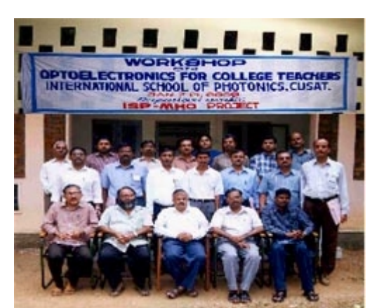
Workshop on Optoelectronics for College Teachers –Some of the participants and resource persons.

Aimed at reaching worldwide viewers, the website aspires to attract research collaborations of other leading research groups with ISP. Besides, it reaches out to the student community with information