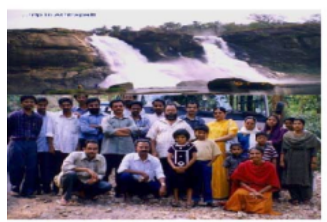
The ISP family during an outing to the picturesque waterfalls of Athirappally near Cochin